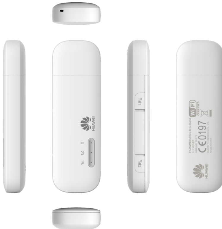
Figure 1-1 E8372 profile

Figure 1-1 shows the profile of the E8372.