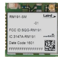
Actual Size (25.4mm x 25.4mm)

Support works onsite with Laird engineering to speed your design to market.