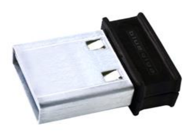
Figure 1: BLED112 Bluetooth Smart USB dongle

BLED112 Bluetooth Smart Dongle integrates all Bluetooth Smart features. The USB dongle can a virtual COM port that enables simple host application development using a simple application programming interface. The BLED112 can be used for Bluetooth Smart development. With two BLED112 dongles you can quickly prototype new Bluetooth Smart application profiles by utilizing Bluegiga Profile Toolkit<sup>™</sup> and also automate in module software functions with Bluegiga BGScript<sup>™</sup>.